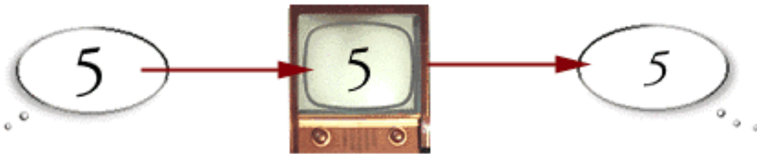
Picture I: Example of the learning 'from technology/media' -approach

A number of solutions of educational technology are based on the theory of behaviorism and designed to strength the 'from teacher to students' module. In some cases the technical solutions have even tried replaced the human teacher. The approach has lead to solutions where knowledge has been tried to transfer straight 'from technology or media to students'. The assumption has been that students learn best 'from' rather than 'with' technology and other humans. The learning has been seen only as an individual process of assimilating knowledge (Reeves 1997).